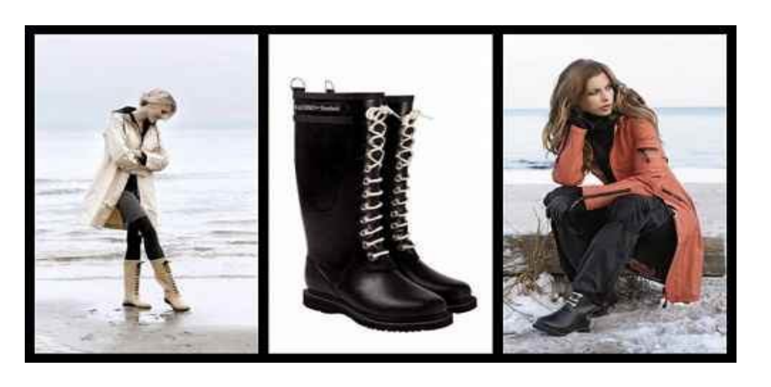
Texone s.r.o. Nitrianska 70 , 95801 Partizanske Slovakia www.texonesro.com